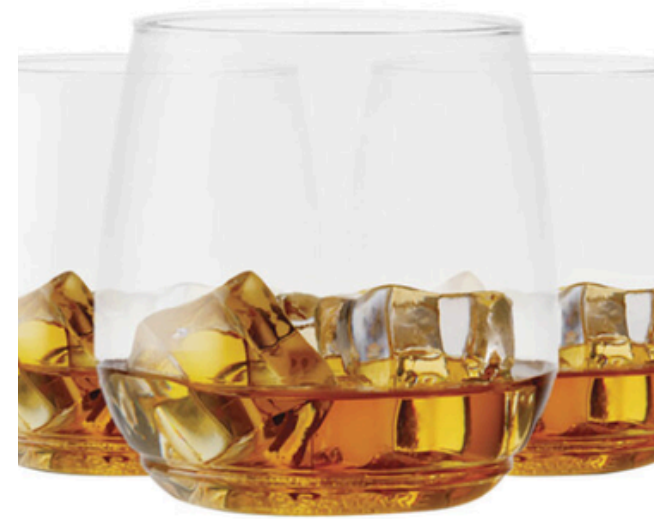
High-quality stemless glassware