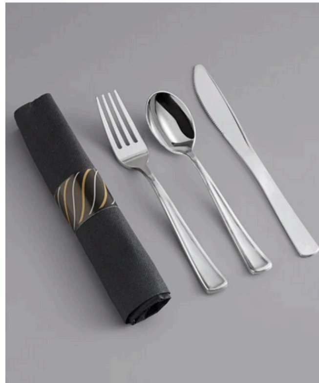
High-quality napkin and utensil kits