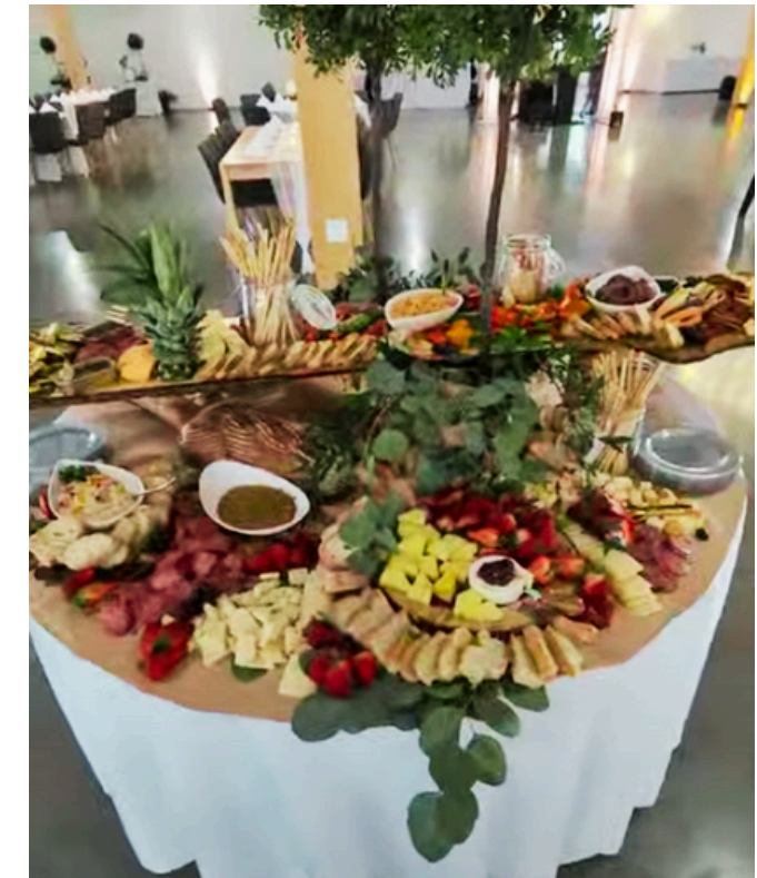
Fresh greenery for a polished finish

*China, silverware, and glassware are available options upon request. (Add'l $)